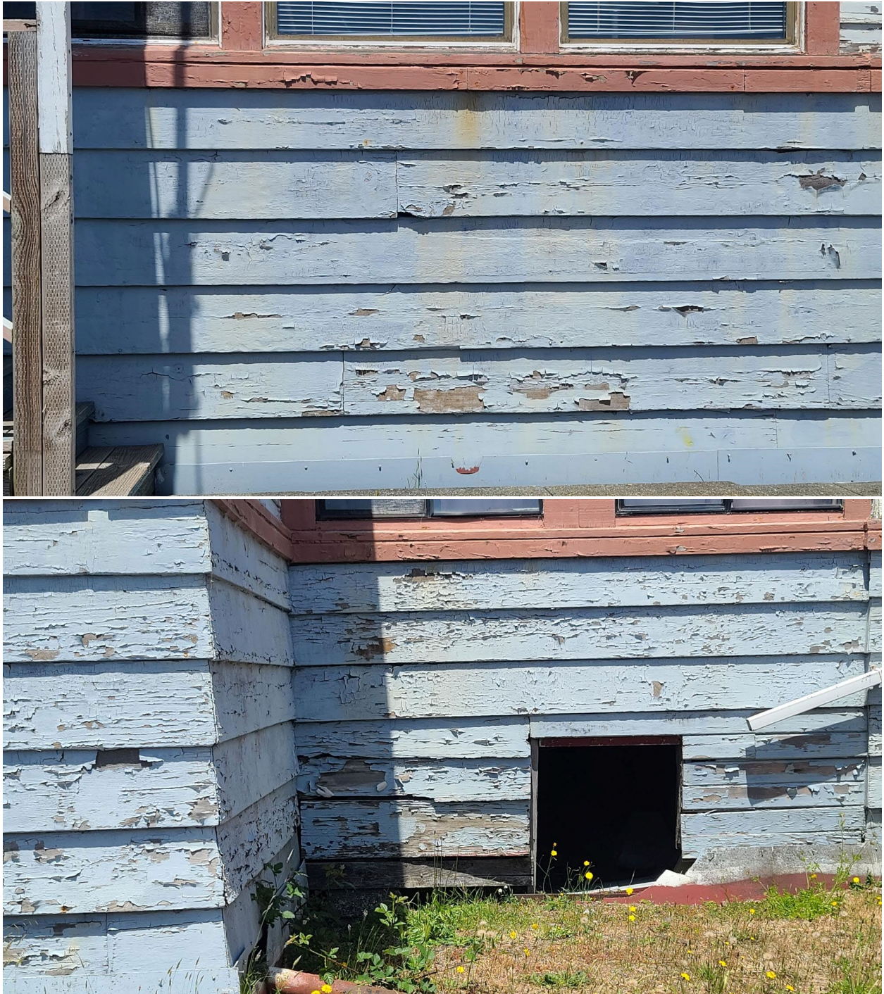
Figure 3. Sample walls with peeling paint.