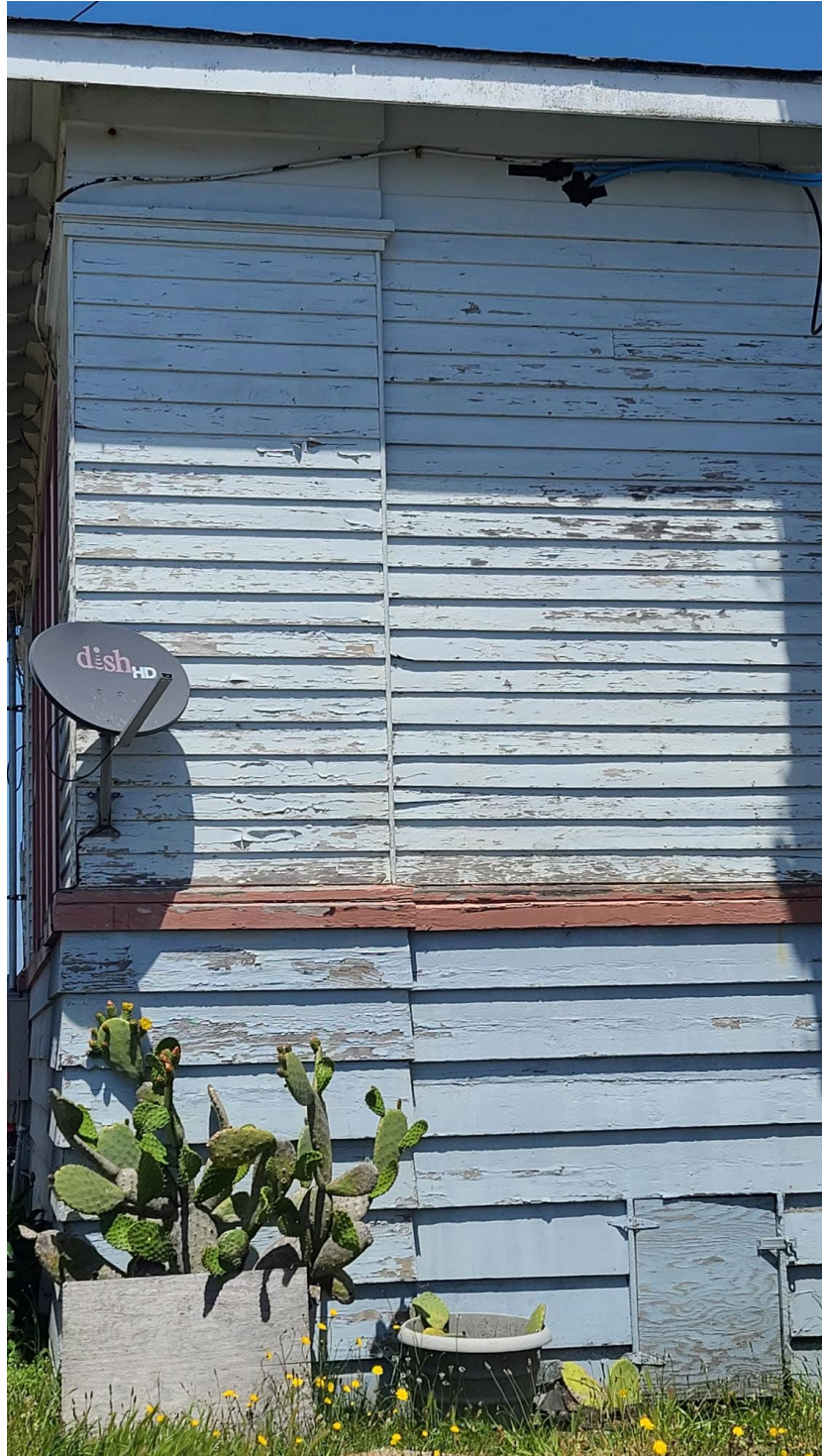
Figure 4. Sample wall with peeling paint.